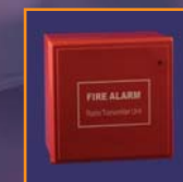
EDA-T6000 Radio I/O Unit

See Associated data-sheets for full equipment specification www.electrodetectors.co.uk/data-sheets Only a small selection of devices are shown. For the complete range and for a full specification please visit our website.