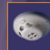
EDA-D5000 Heat Detector