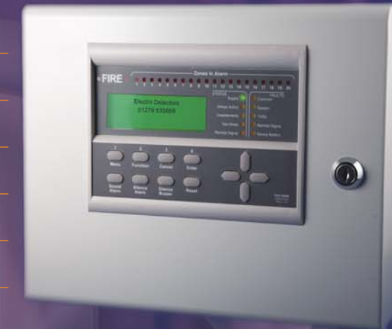
20 Zone Panel pictured. 8 and 100 Zones Available.