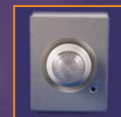
EDA-A6030 Sounder/LED Strobe