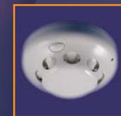
EDA-R5000 Smoke Detector