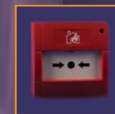
EDA-C5000 Manual Call Point