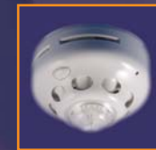
EDA-R6030 Smoke Detector/Sounder and Beacon