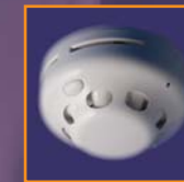
EDA-R6000 Smoke Detector/Sounder