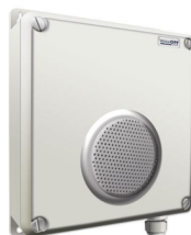
Audio Indication Automatic Queue Control System