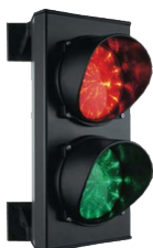
Visual Indication Traffic Lights & LED strip Selection